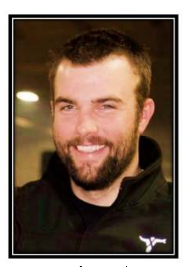
In Loving Memory