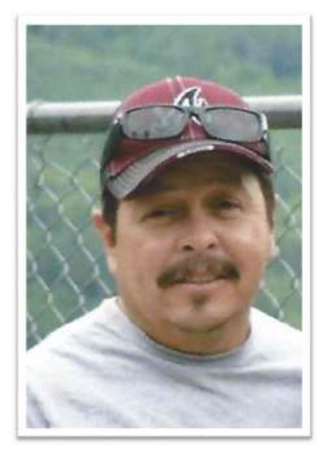
In Loving Memory